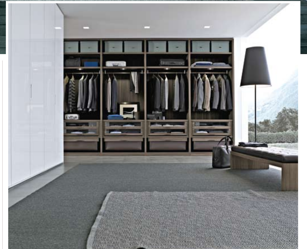
Right: Poliform's Senzafine Wardrobe. Internal structures are protected with easy-clean, easy-care melamine. Doors range from simple and minimal to exquisite edge and frame details in finishes including lacquer, glass, timber and leather.

Studio.Italia 98 Carlton Gore Road, Newmarket, Auckland. Ph: 09-523 2105 www.studioitalia.co.nz