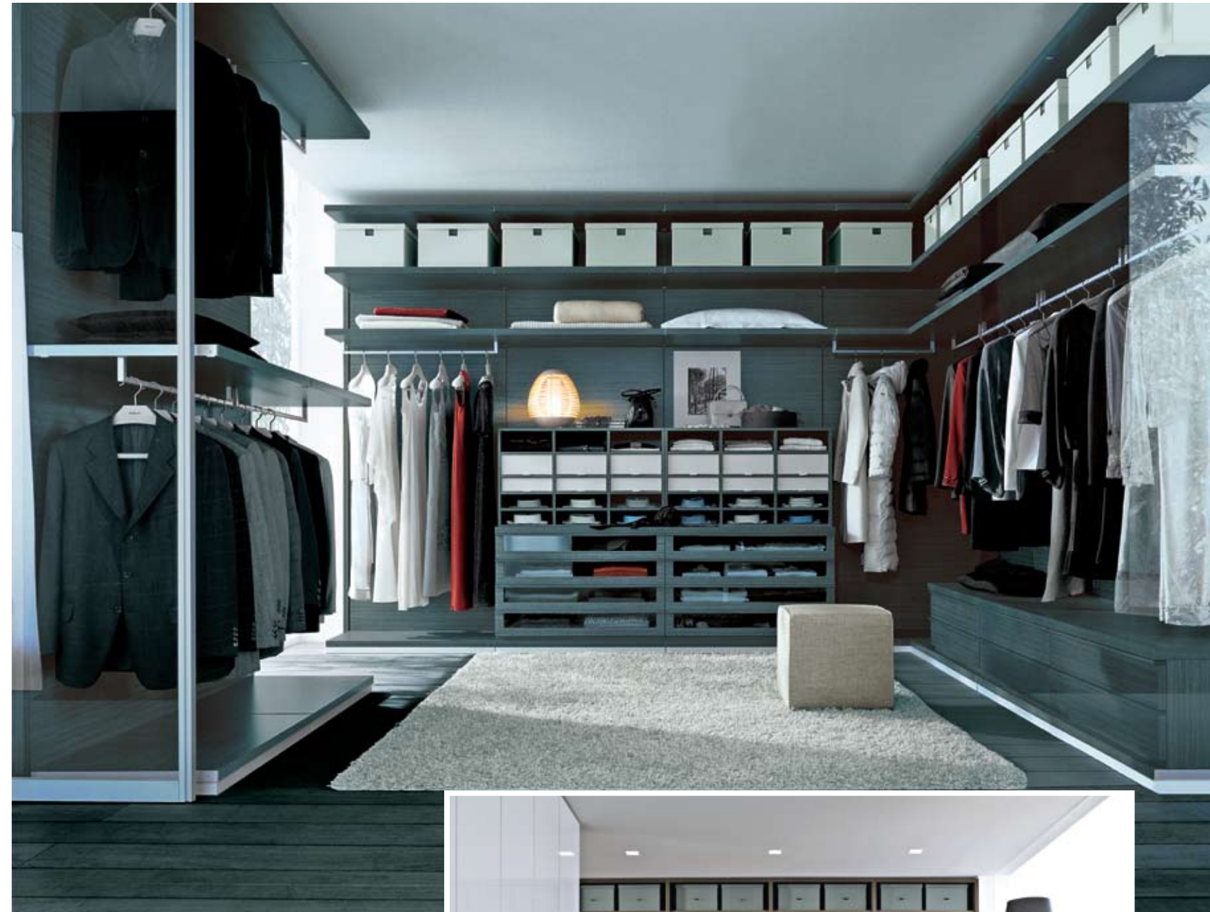
Above: Ubik wardrobe by Poliform. Wardrobes can be adapted to maximise any space and be equipped with myriad accessories: shelves, rails, pull-out trouser holders, tie and belt dividers, drawers and storage.