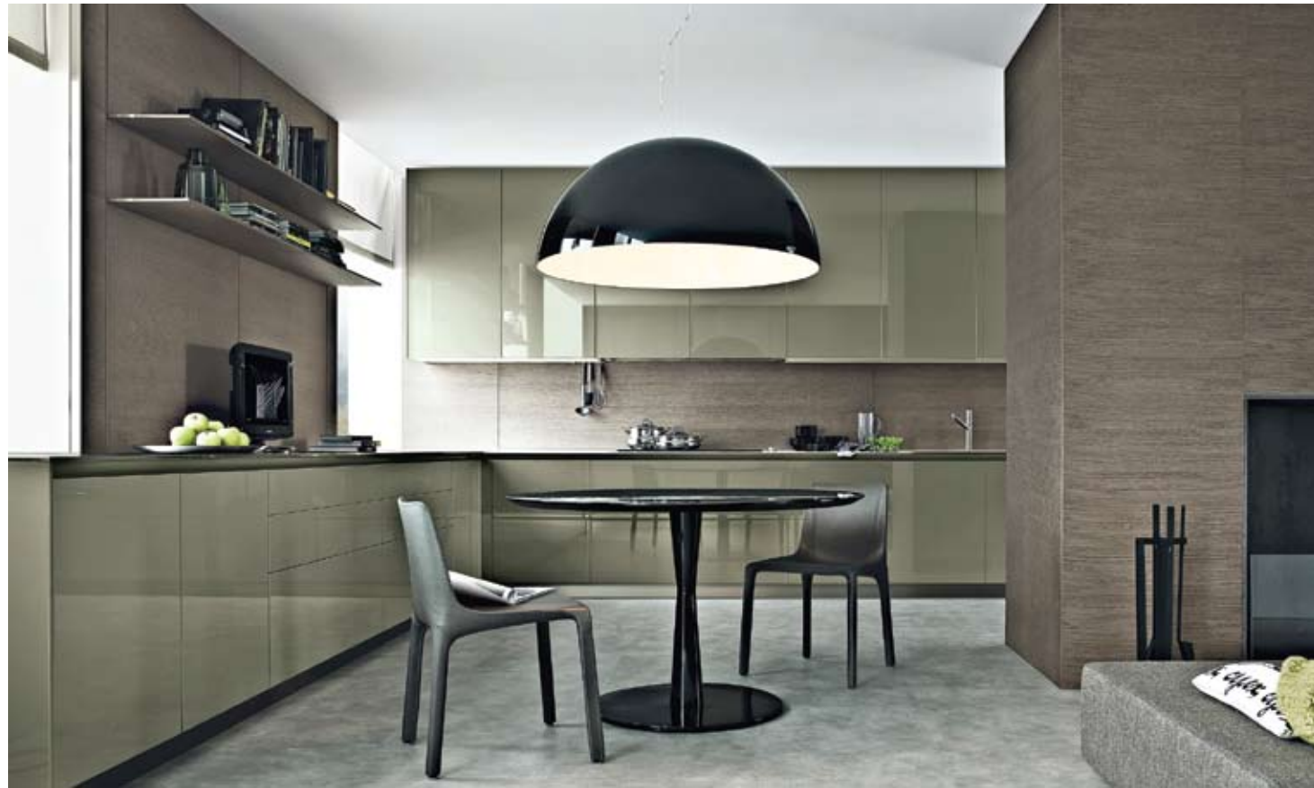
Above: Sleek and simple – The Twelve Kitchen design by Carlo Colombo for Varenna Poliform comes complete with electric drawers, glossy lacquer doors and warm Bruno Oak finish. Below: Kyton kitchen design by CR&S Varenna for Poliform makes a striking statement with light/dark contrast. The gulf island layout allows for complete integration with living areas.