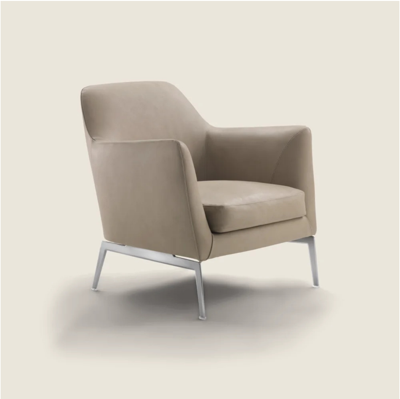
LUCE ANTONIO CITTERIO 2015 ARMCHAIRS