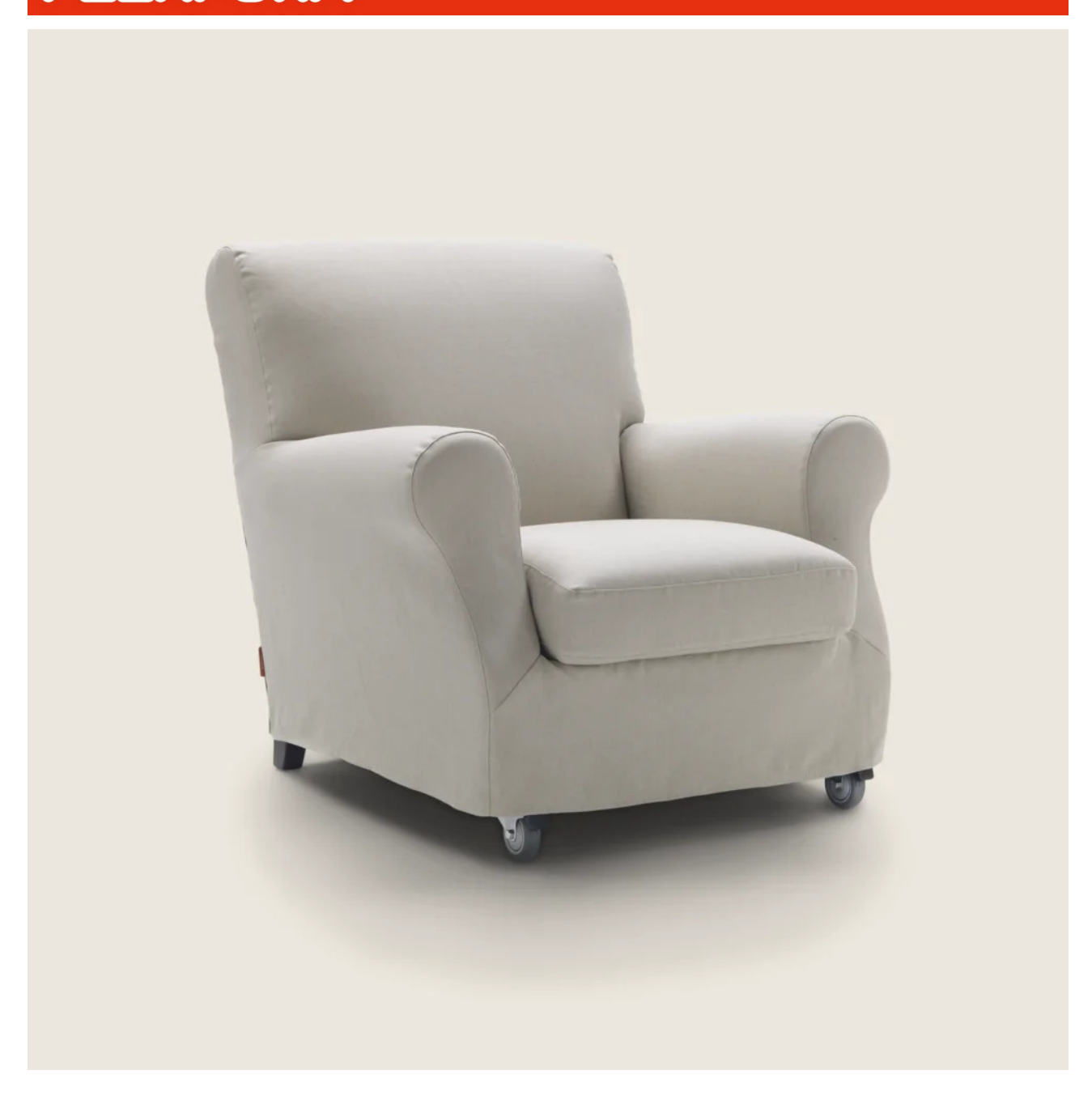
NONNAMARIA DESIGN CENTER 1985 ARMCHAIRS