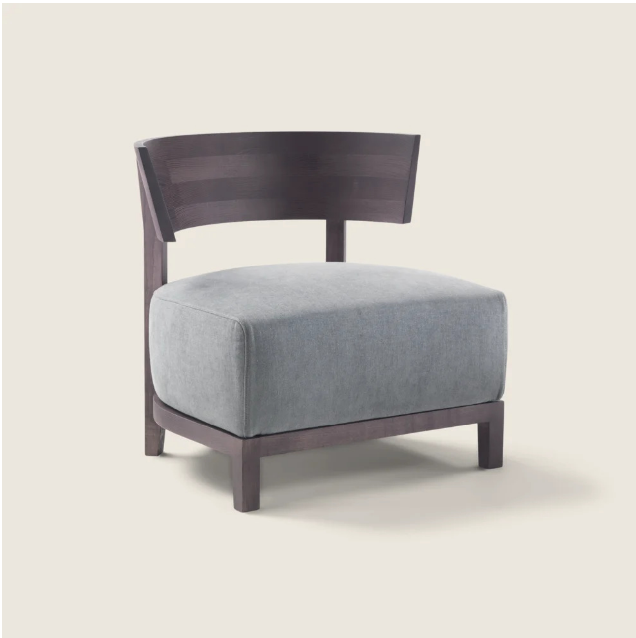
THOMAS ANTONIO CITTERIO 2000 ARMCHAIRS