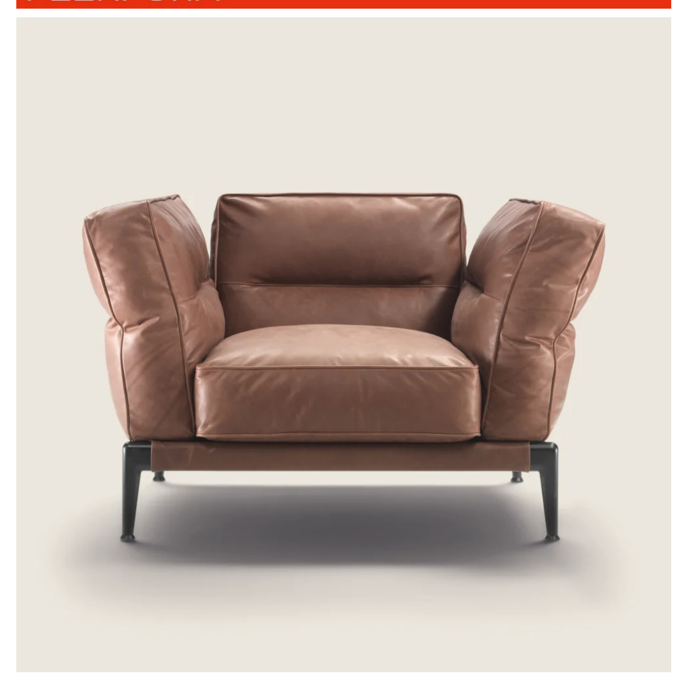
ADDA ANTONIO CITTERIO 2017 ARMCHAIRS