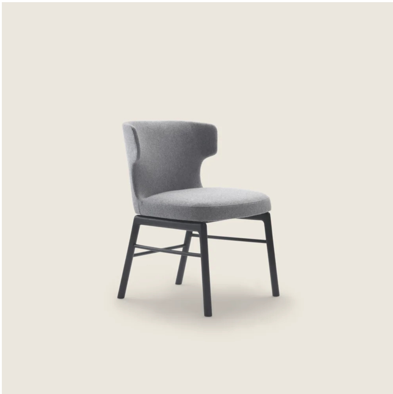
VESTA ANTONIO CITTERIO 2023 DINING CHAIRS/CHAIRS