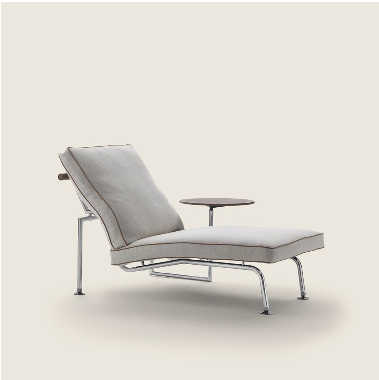
GINGER ANTONIO CITTERIO 1984 CHAISE LONGUE/DORMEUSE