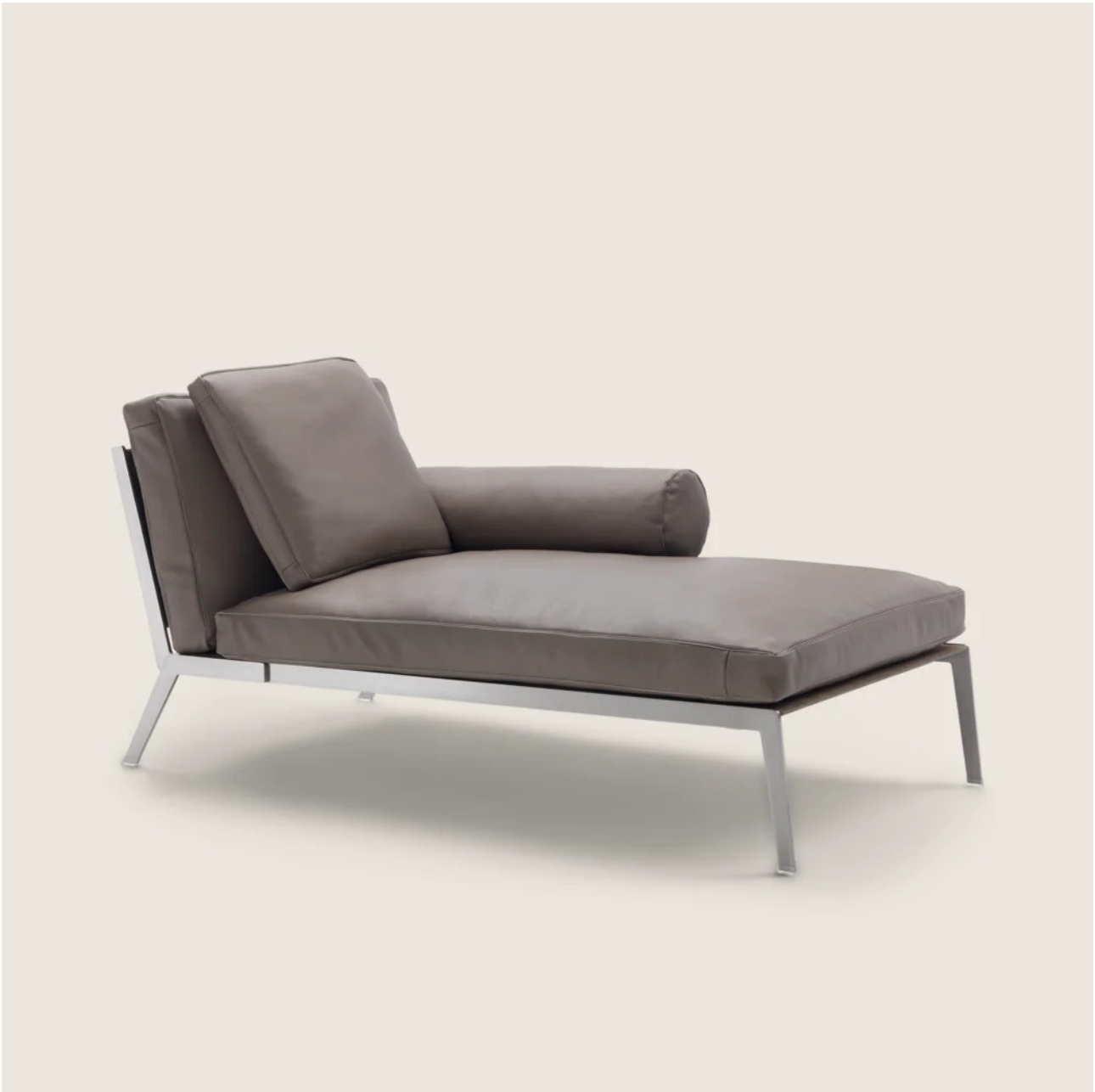
HAPPY ANTONIO CITTERIO 2005 CHAISE LONGUE/DORMEUSE