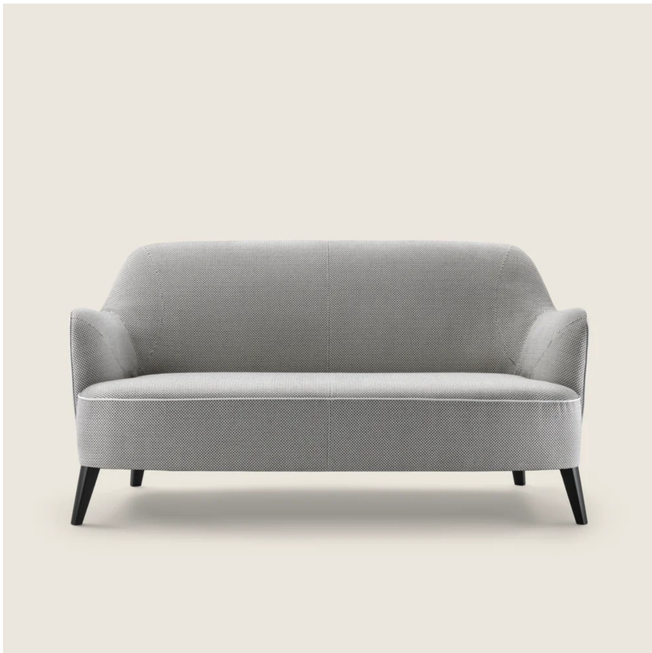
LYSANDRE ROBERTO LAZZERONI 2013 STAND-ALONE SOFAS