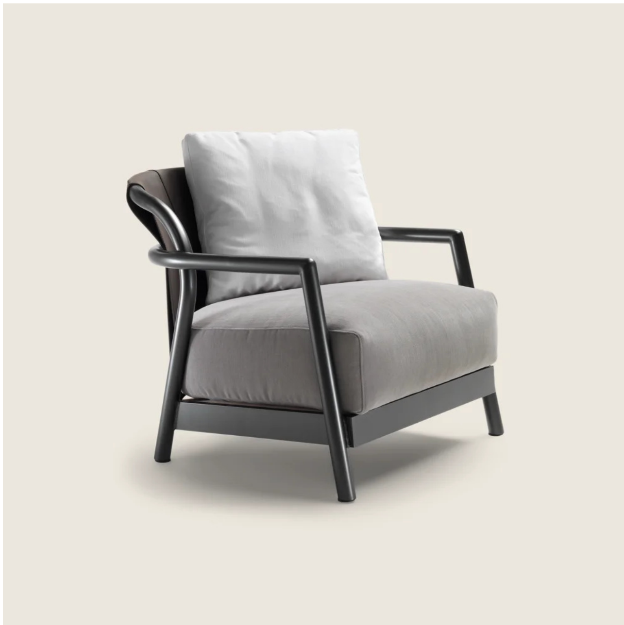
ALISON OUTDOOR CARLO COLOMBO 2019 ARMCHAIRS