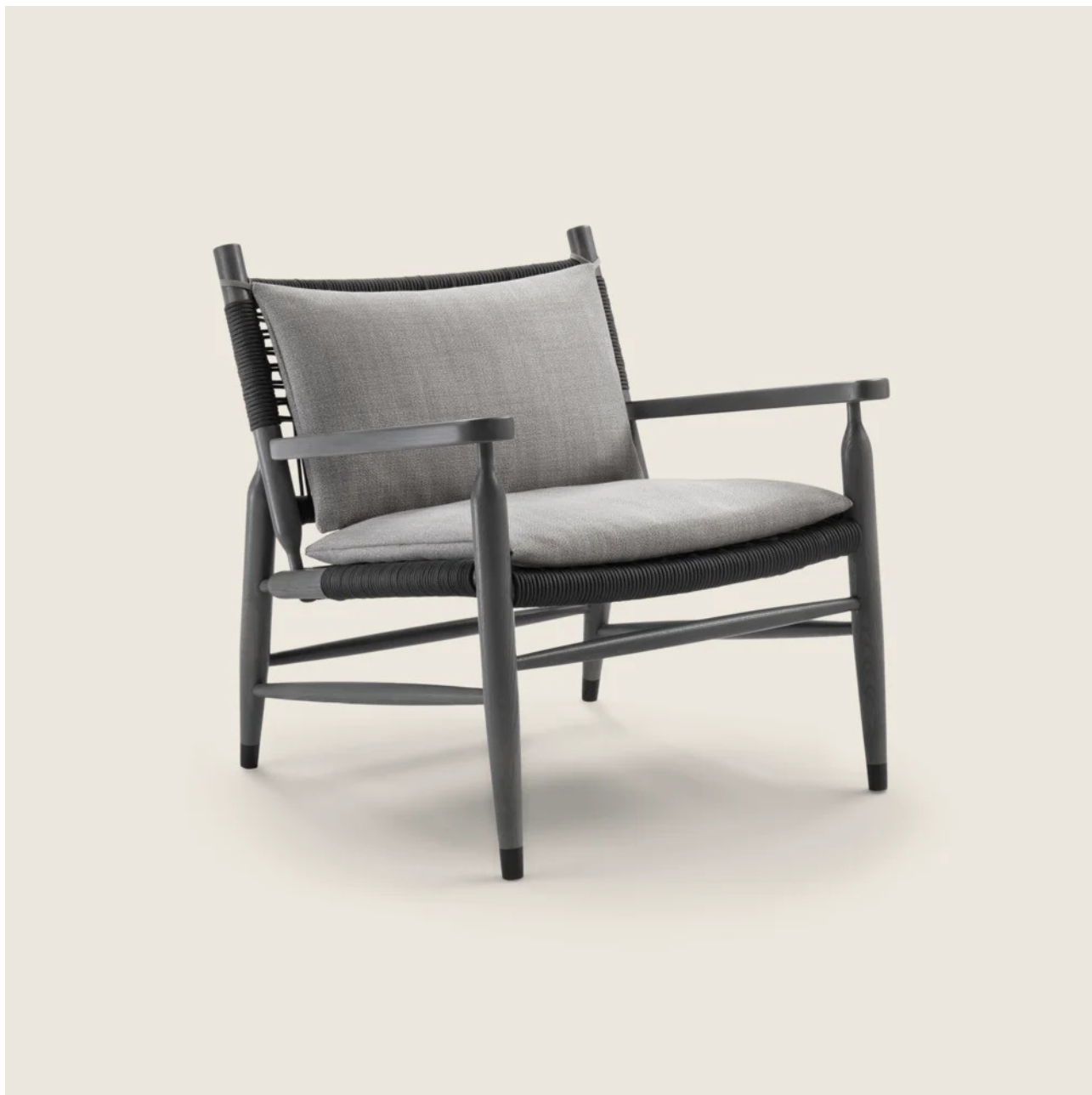
TESSA OUTDOOR ANTONIO CITTERIO 2020 ARMCHAIRS