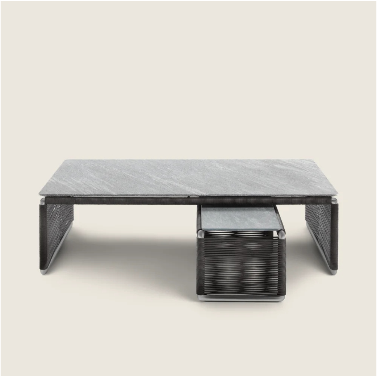
TINDARI OUTDOOR ANTONIO CITTERIO 2019 COFFEE AND SIDE TABLES